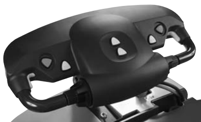
Steerhead includes two butterfly controls, allowing thumb or fingertip actuation of travel and direction.

Contact your Nissan Forklift sales representative for details about load wheel location or fork length requirements for your application.