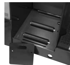
Optional battery rollers make change out quick and easy.