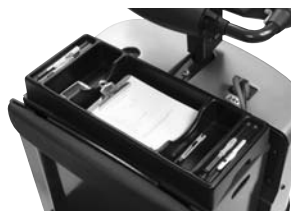
Optional convenience tray keeps operator items organized.